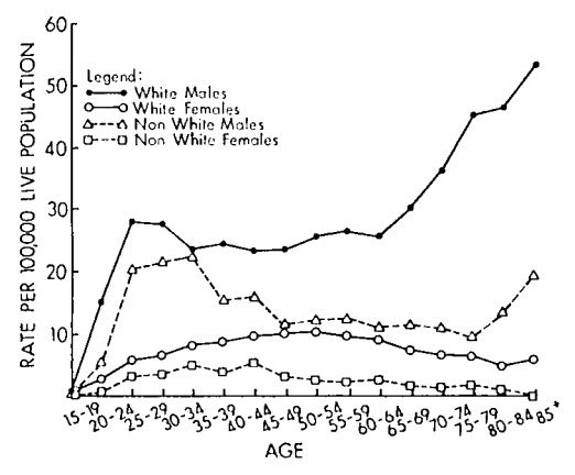
Figure 2. Suicide rates in the United States by age, sex, and race, 1980. (National Center for Health Statistics, Vital Statistics of the United States, 1980, Vol. II, Part A, DHHS Pub. No. (PHS) 85-1101. U.S. Government Printing Office, 1985.)

For example, the success rate for elderly persons who attempt suicide through violent means approaches 100% as compared to adolescents who succeed approximately 1% of the time. Similarly, it is speculated that the attempt-success ratio of silent suicide by nonviolent means among the elderly also approaches 100% simply because the motivation or factors creating the desire to