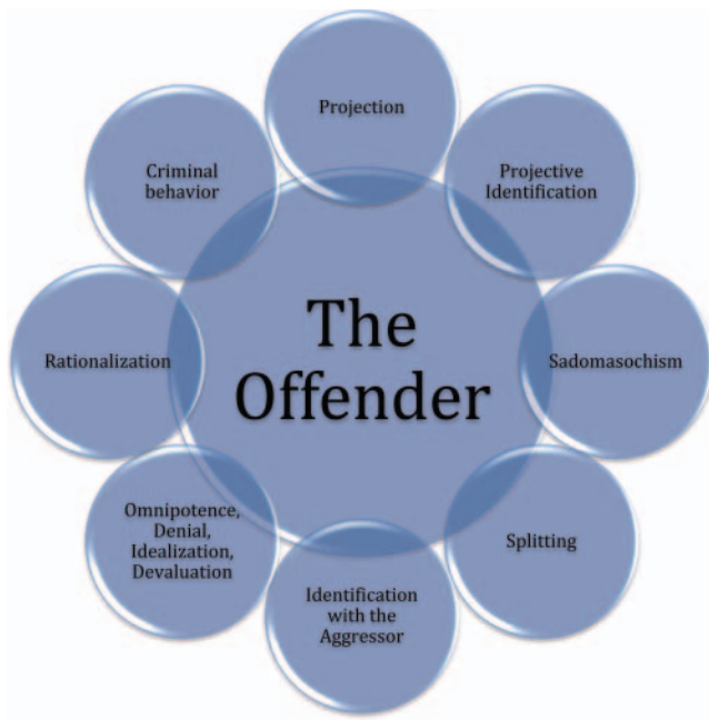
Figure 1. Defense Mechanisms in the Forensic Population—Adapted from Protter and Travin. 22

defenses, whereas unreliable or rejecting attachment figures tended to lead to development of pathological defenses. Violence may accordingly be encountered in the context of insecure or ambivalent attachments.